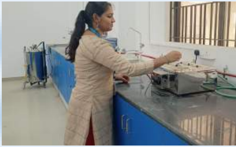
Biochemistry and Immunology Lab