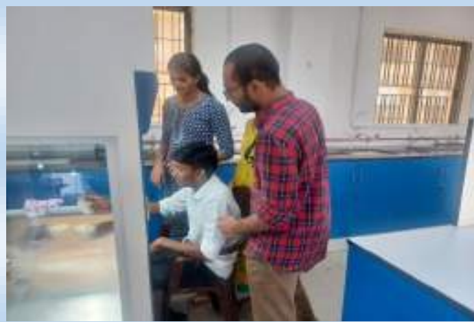
Tissue Culture Lab