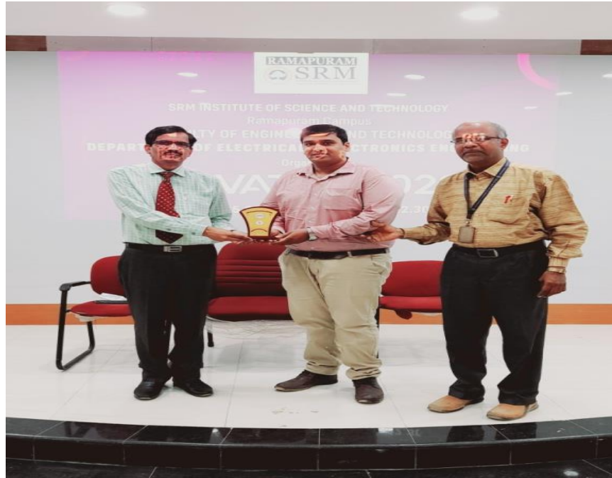
Glimpse of the event: